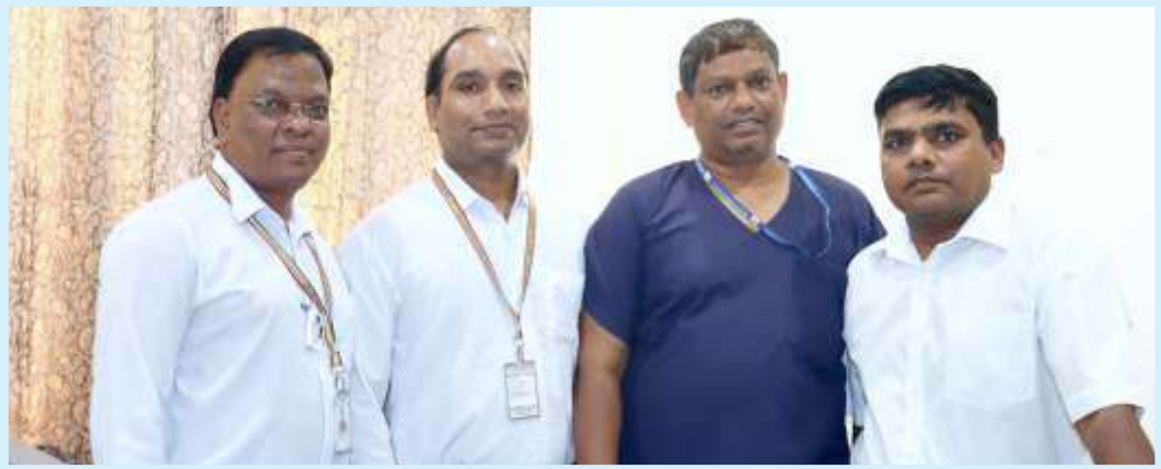
↓ X-Ray Team