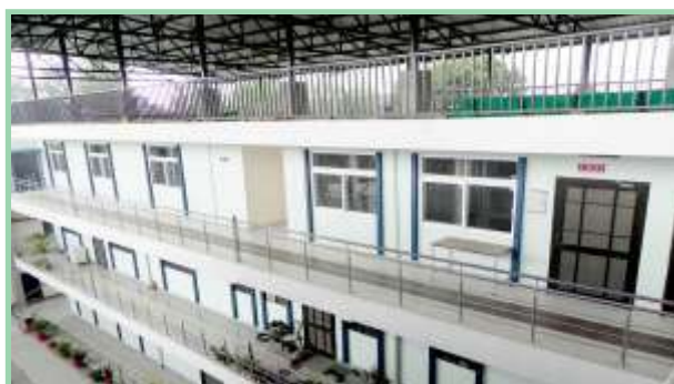
New CBID floor in Anugrah Building