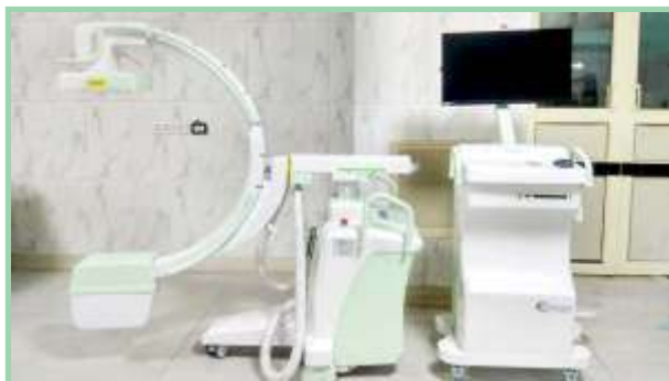
New C arm Machine