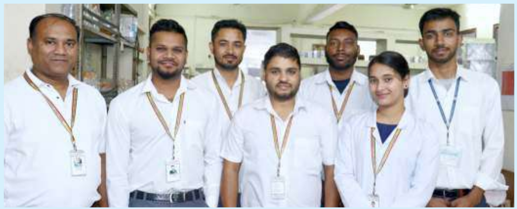
↓ Pharmacy Team