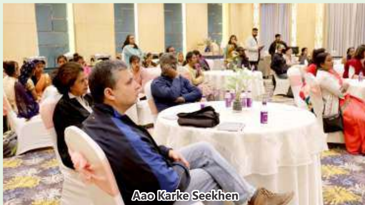
Aao Karke Seekhen

In 2022 – 2023 we are delighted with some important achievements such as being selected as State Mental Health Authority in multiple different roles (SMHA) and Review board members, as well as achieving access to essential mental health medicines at both blocks of CHC due to strong advocacy strategy and networking. We also participated in drafting a policy for a State de-addiction centre which was a good experience to know how the policy is being drafted and then go through various processes and this allowed us to advocate for disability inclusiveness in the structural design.