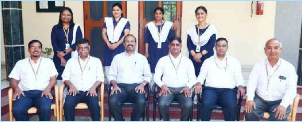
↑ Administrative Office Team