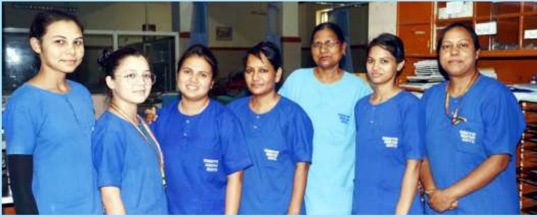
↑ Maternity Ward Team