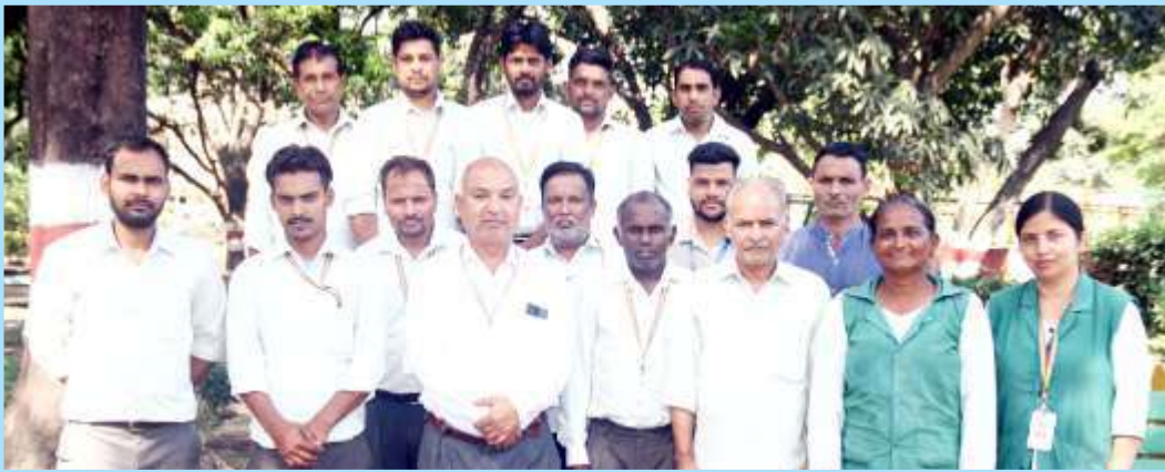
↑ Maintenance Team