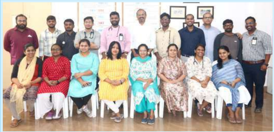
↓ Medical Team