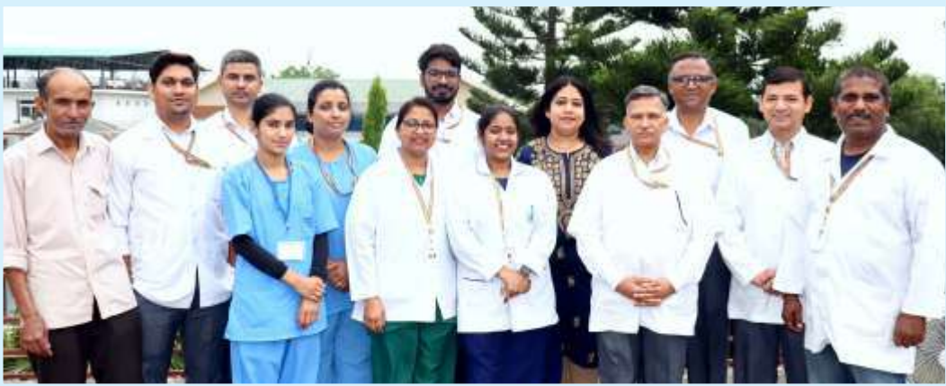
↑ Laboratory Team