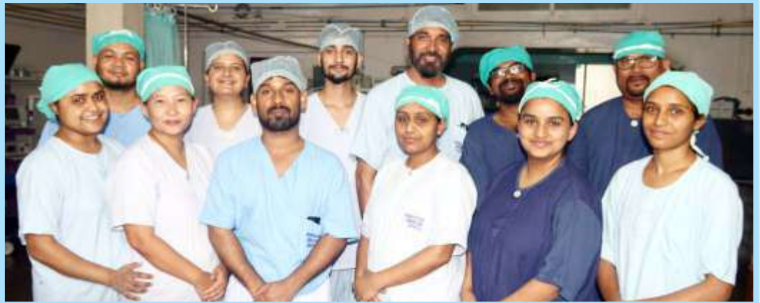
↓ Operation Theatre Team