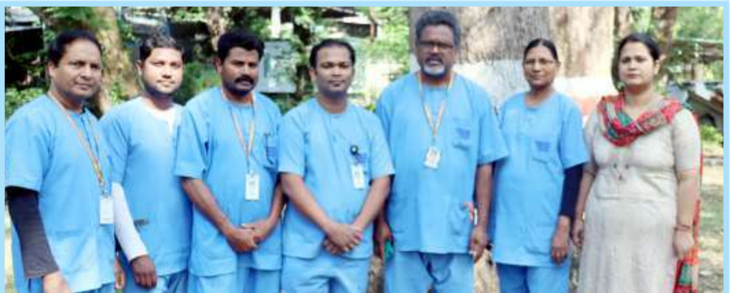
↓ C.S.S.D. Team