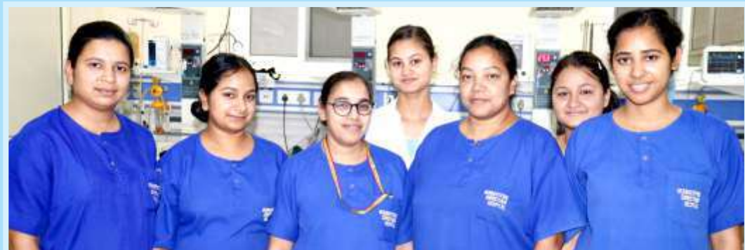
↑ NICU Team