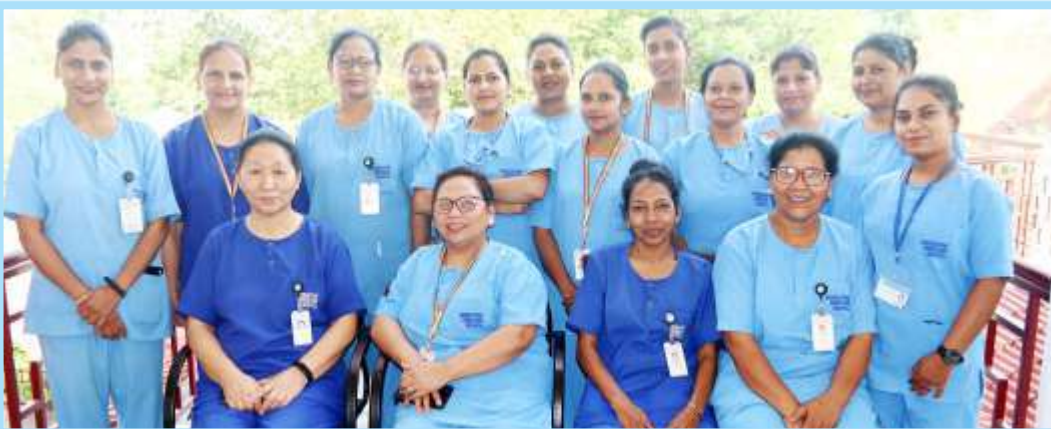
↑ O.P.D. Staff