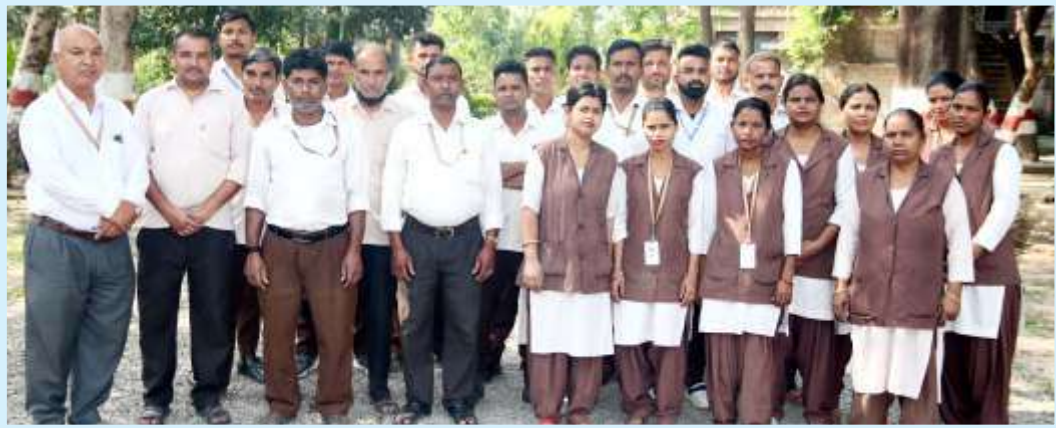
House Keeping Team