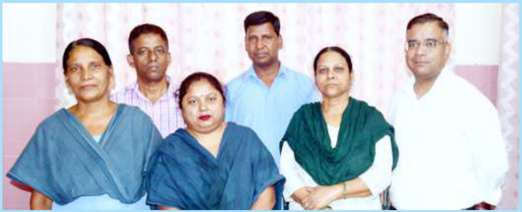
↓ Mess & Guest Room Team