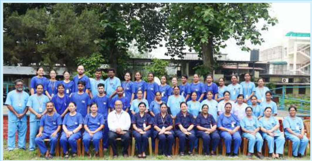
↑ Nursing Team