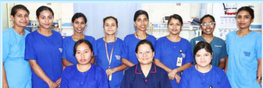
↓ I.C.U. Team