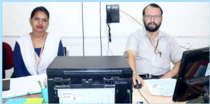
↓ Ayushman Bharat Services Team