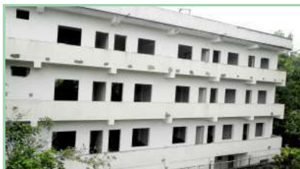
Staff and Students Hostel