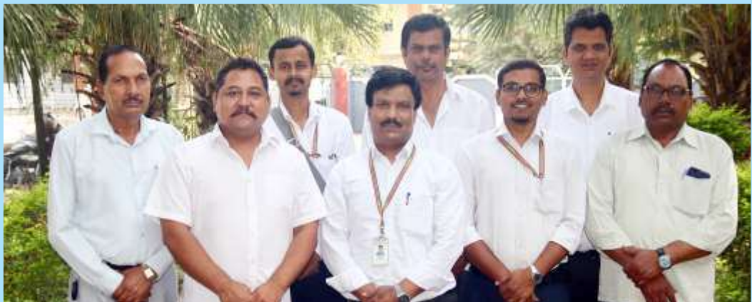
↓ Biomedical & Transport Team