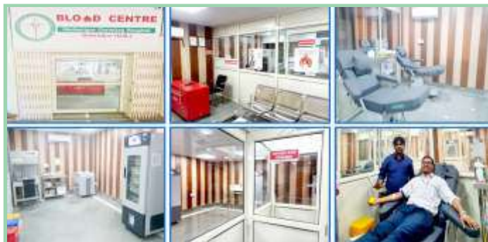
HCH Blood Center