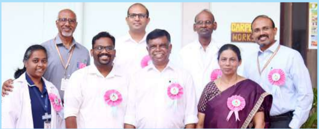
↓ Unit officers