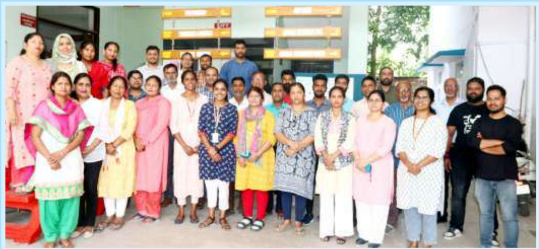
↑ C.H.D.P. Team