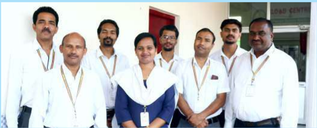
↑ Billing Department Team