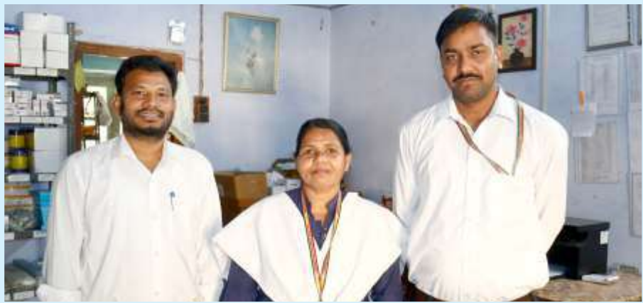
Central Stores Team