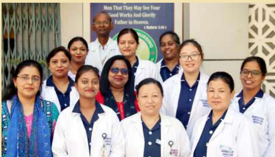
School of Nursing Team