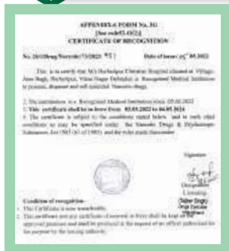
Narcotic Drug License