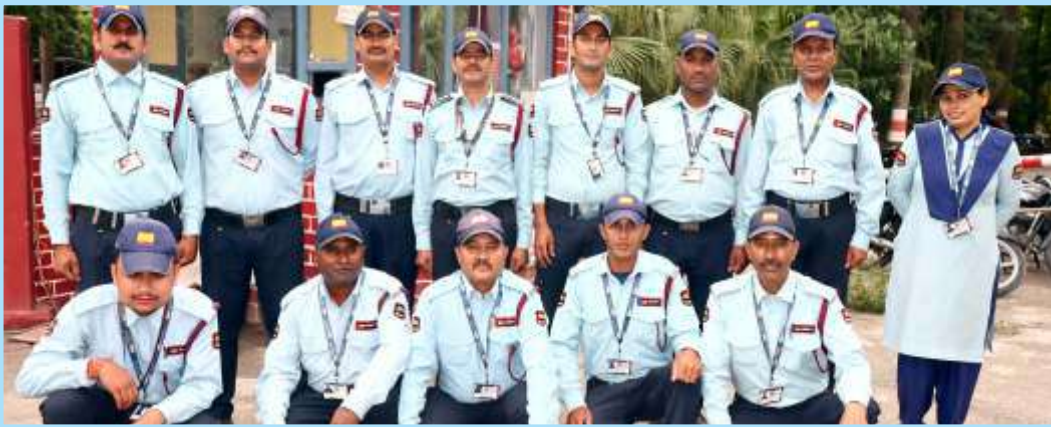
↑ Outsourced Security Team