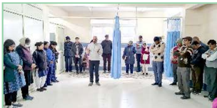
Renovated Neonatal Intensive Care Unit