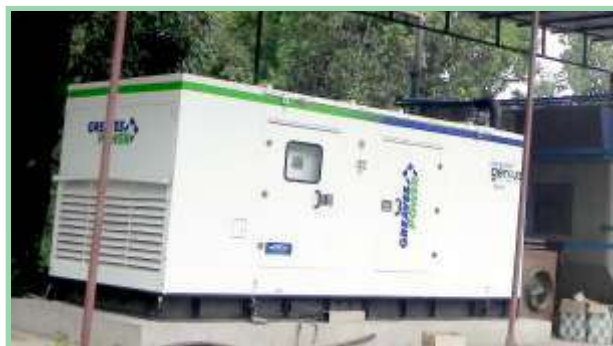
Genset 320 KVA