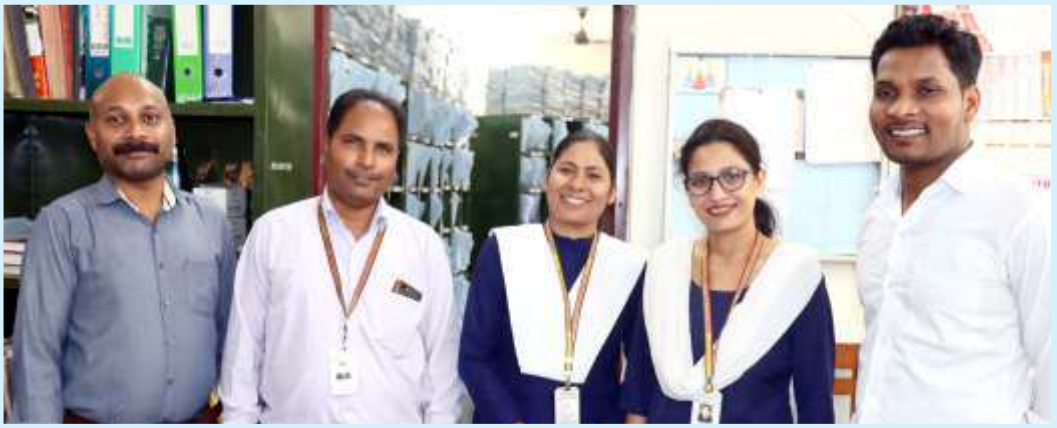
Medical Records & Registration Department Team