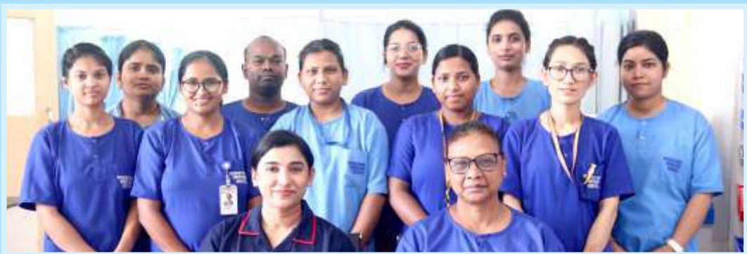
↓ Surgical Ward Team