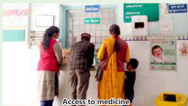
Access to medicine

By working with the team, we further developed our strong relationship with the health department and officers: there is high credibility amongst them with respect to the Burans project. With permission from the Chief Educational officer of the two blocks we work in, we conducted Nae Disha sessions with 64 groups (655 girls and 190 boys participated) in 24 government schools. also got an invitation from the 24 School to run a workshop on adolescent health apart from the Nae Disha program. We also formed 64 caregiver groups to run the Nae Umeed module where 320