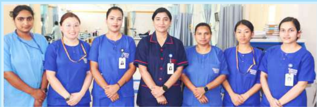
↑ Medical Ward Team